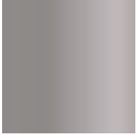
Matte White Lacquer - MWL